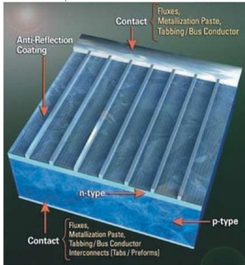
Fig. 1. Crystalline silicon solar cell.

To navigate the world of PV module assembly, the seasoned SMT practitioner needs to know the