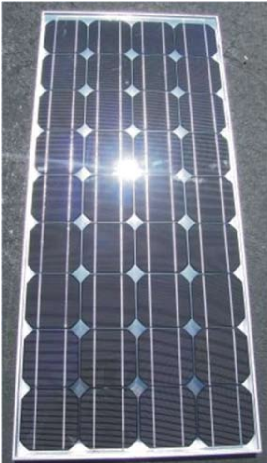
Fig. 5. Complete interconnected solar cells

There are two basic process steps used to assemble a PV module: photovoltaic cell interconnect by stringing, and PV module assembly by bussing. Connecting individual PV cells into a PV module is called solar cell tabbing or solar cell interconnect stringing. In this process, the cells are electrically connected using stringing ribbon. The solder-coated tabbing ribbon is dipped into, or sprayed with, flux. Alcohol-based flux is common for this application, although VOC-free fluxes are also used. An air knife is often used to eliminate excess flux. As in the SMT assembly process, there is also the option of printing flux or solder paste onto the PV cell itself. A no-clean paste with little or no flux residue is best, as it reduces process steps and delivers the most reliable solder joints. This solder paste printing step is identical to that in the surface mount assembly process. Solder reflow is typically performed at the tabbing machine. The ribbon is